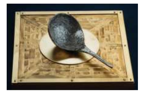
Plate 2. Ancient Chinese ("south-pointer") compass (around 200 BCE)<sup>98</sup>

He divides his wealth into four: One part he should enjoy,<sup>97</sup> With two he invests in his work, And the fourth he should save Should there be any misfortune.